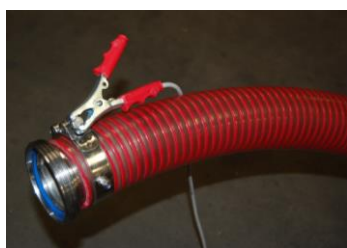
Optional Flux Detector applied and connected on BCM pump with inverter