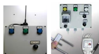
- sensors and automation