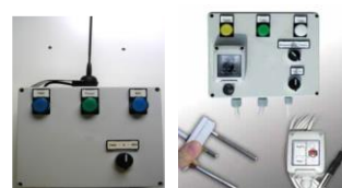
- sensors and automation