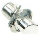
- customized fittings