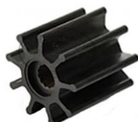
- neoprene impellers